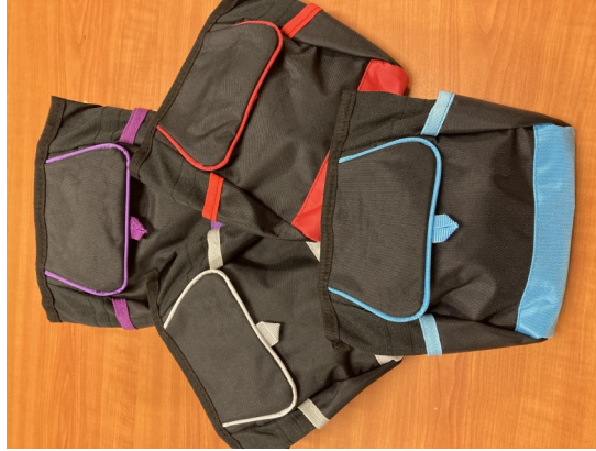
Pictured: Puppingtons Trainers Pouch

NCODC are now stocking Puppingtons Treat Pouches. Two different designs available - $30.00 each (including belt)